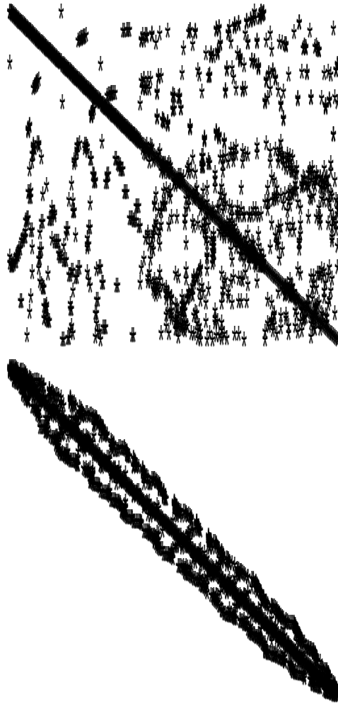
Figure 2 Sparsity of the matrix before (top) and after (bottom) the renumbering